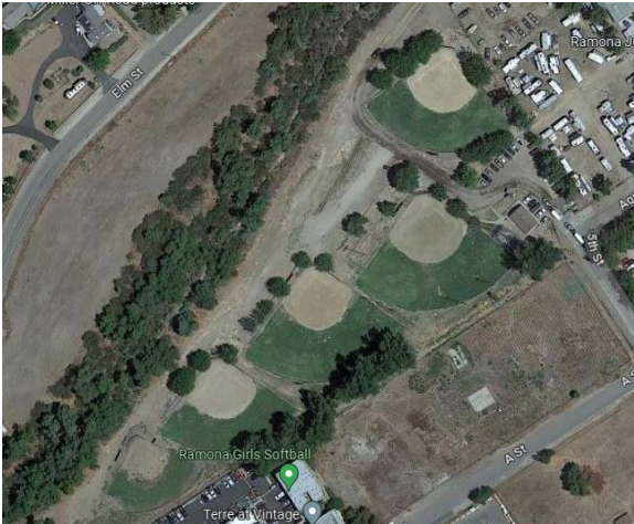
Youth Softball Fields