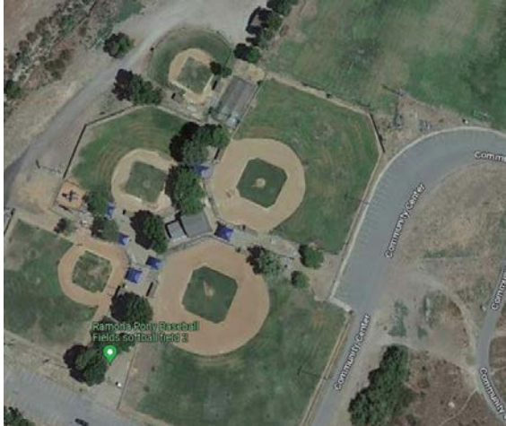
Baseball Fields 1-5