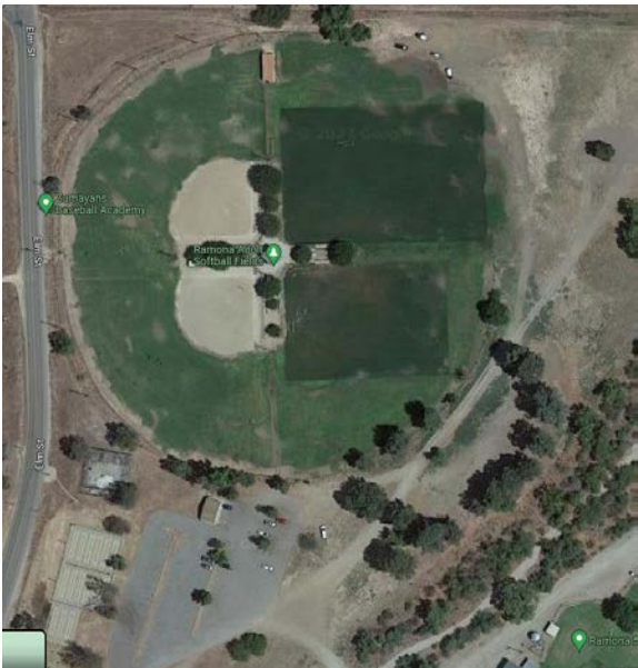
Adult Softball Fields and Back soccer fields