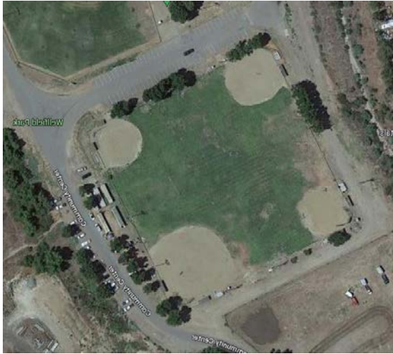
Field Complex 2