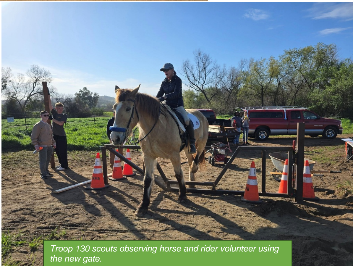
Troop 130 scouts observing horse and rider volunteer using the new gate.

An Eagle Scout from Troop 130, together with fellow troop members, designed, constructed, and installed a new gate at the Penn Street entrance. The gate allows safe pedestrian and equestrian access to the park while helping deter motorized vehicles. The project was successfully completed on February 21, 2026.