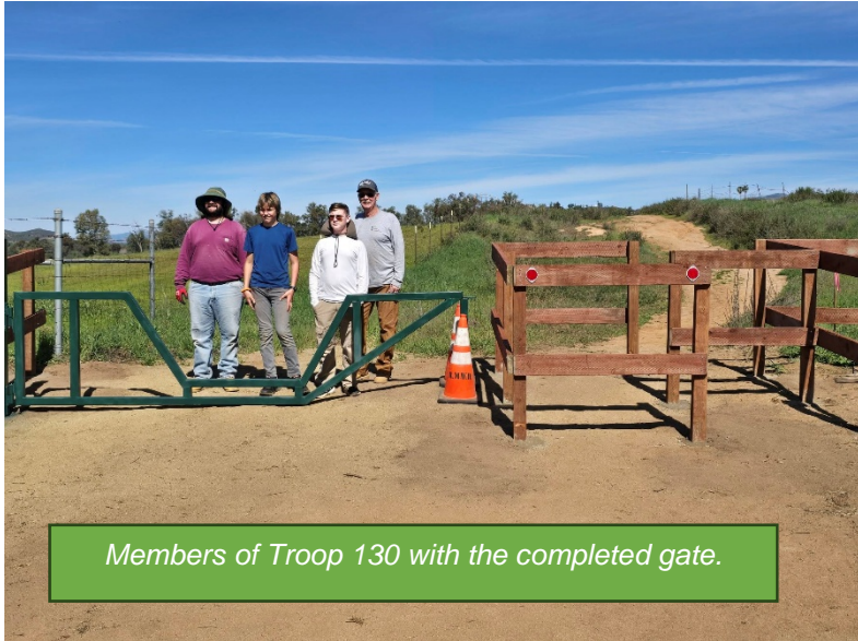
Members of Troop 130 with the completed gate.

Ramona Community Park has a walking trail that connects Penn Street to the park. The park has experienced numerous motorized vehicles entering this walking path creating safety concerns.