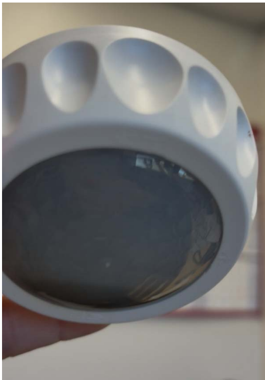
Controller for individual LED lights. Water intrusion disabled.

The new LED lights had 3 controllers that failed. Water seeped into the controller and disabled the connection to receive a signal to turn off. Users had to turn the power off at the main switch.