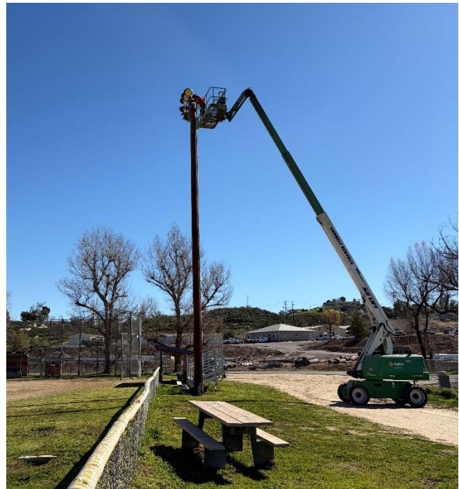
Staff replaced 3 controllers on MU Field #2