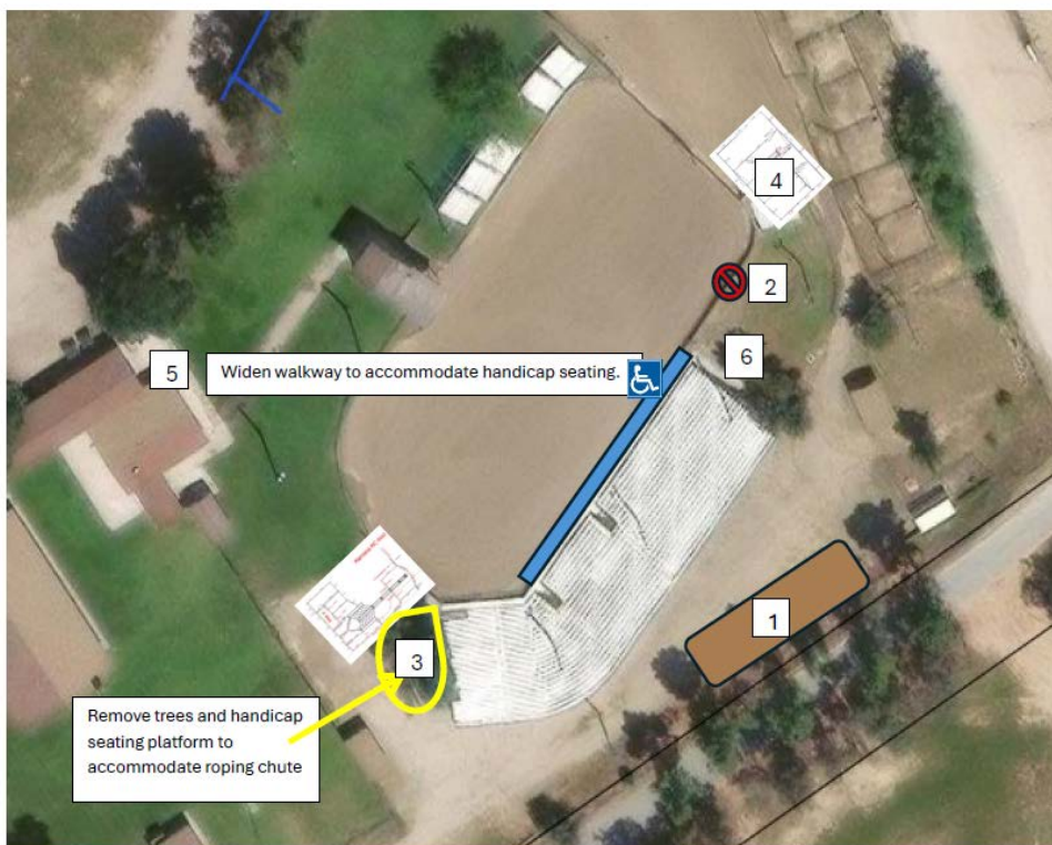
GOALS FOR 2026 RAMONA RODEO

Block wall near tower (across arena from VIP area block wall) will not be removed until after the 2026 rodeo.